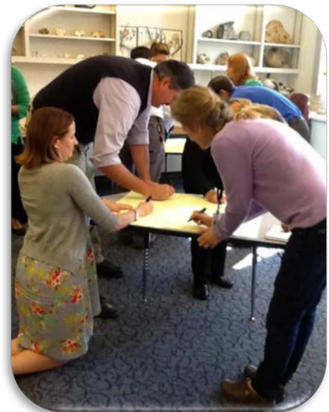
Educators in San Diego find their corners

Step 4: One person from each group shares what was in their diamond.